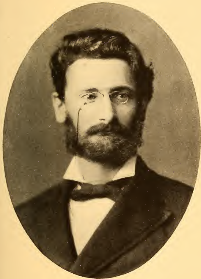
JOSEPH PULITZER AT THE AGE OF THIRTY-FOUR